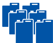
24 x 20 L CANS