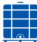
1000 L IBC