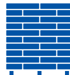
40 x 25 KG BAGS